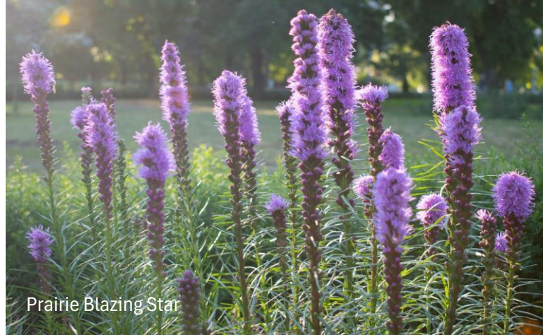
Prairie Blazing Star