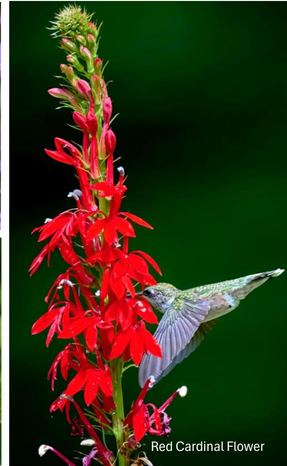
Red Cardinal Flower