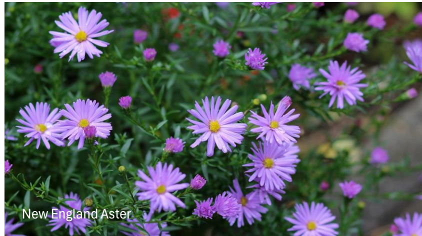
New England Aster