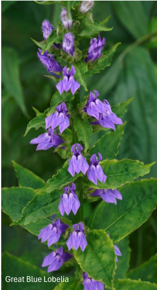
Great Blue Lobelia