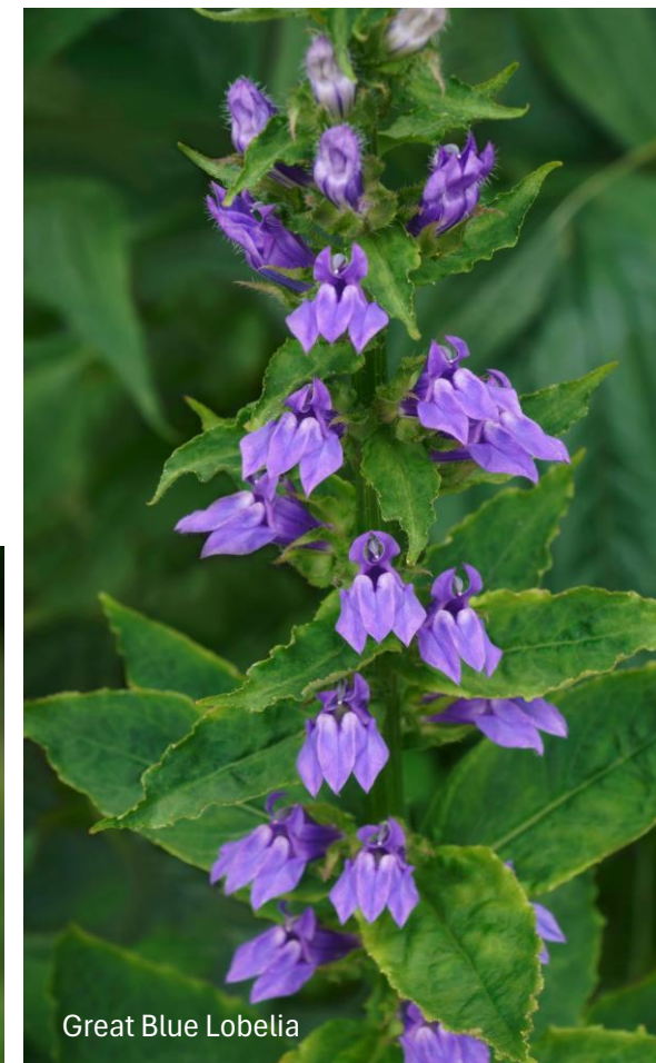
Great Blue Lobelia