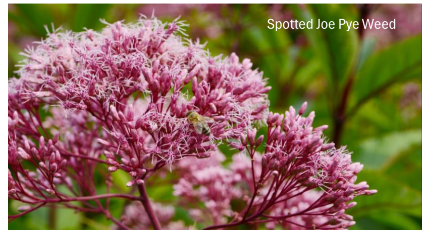
Spotted Joe Pye Weed