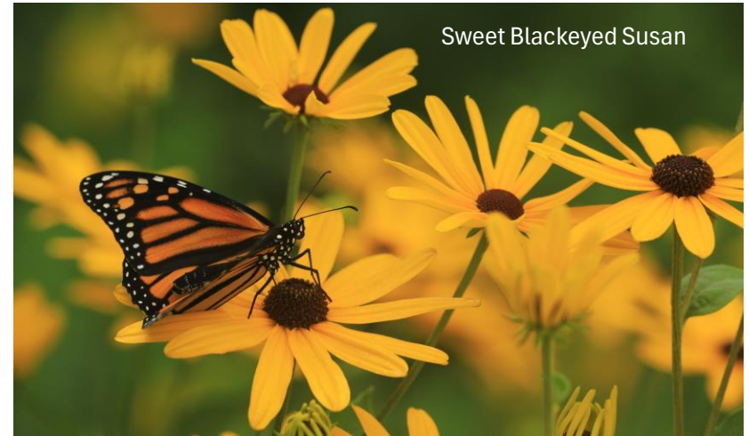
Sweet Blackeyed Susan