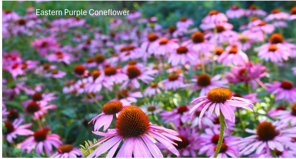
Eastern Purple Coneflower