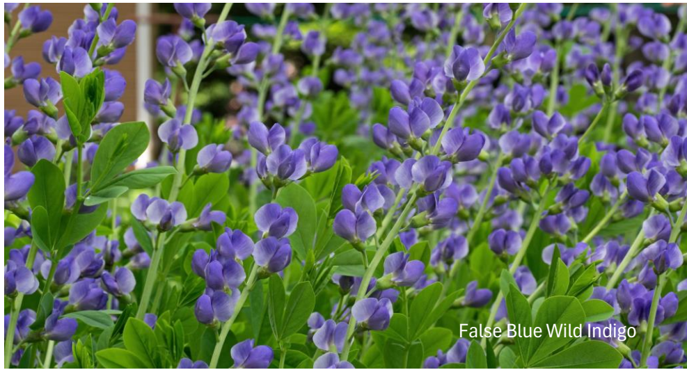
False Blue Wild Indigo