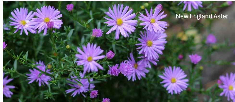
New England Aster