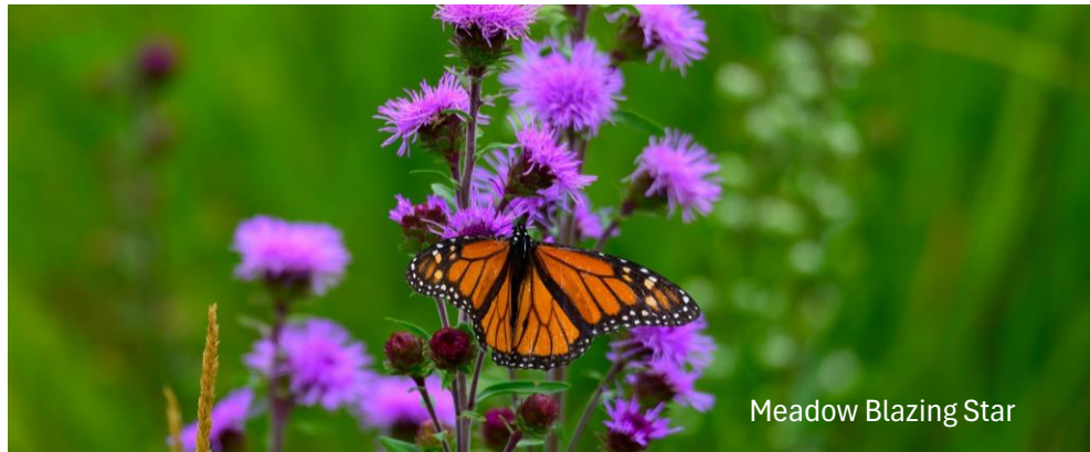
Meadow Blazing Star