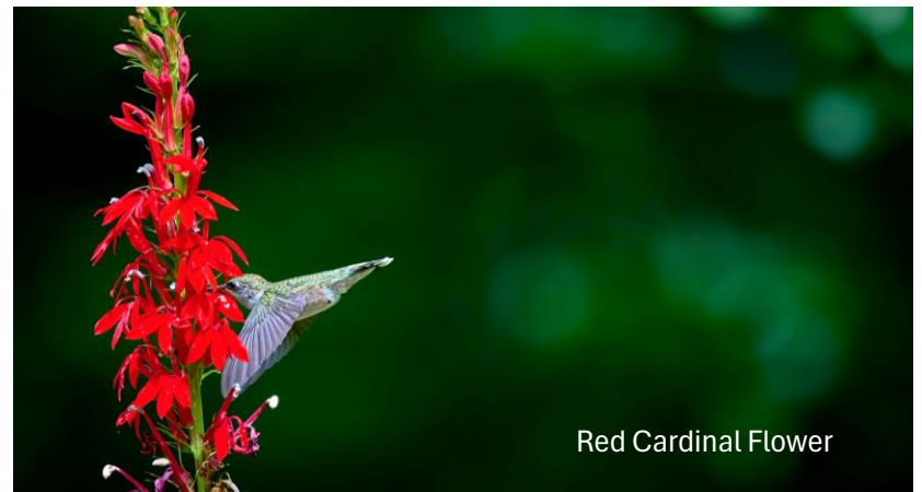
Red Cardinal Flower