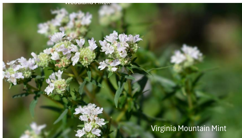
Virginia Mountain Mint